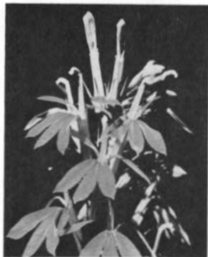
Slides — First: Cardinal Flower.