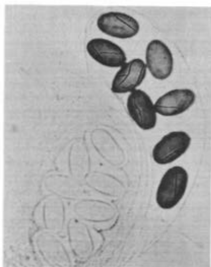
Prints, Light Microscopy — First: Asci—Ascobolus.