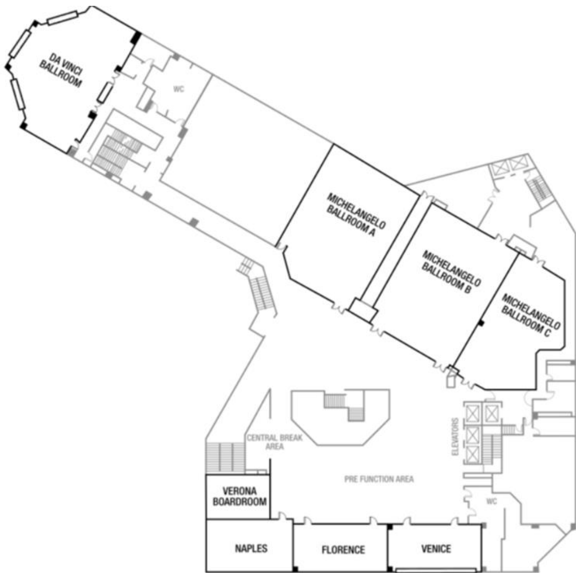
Figure 1. Map of the Convention Level at Delta Hotels Saskatoon Downtown; all events in the Scientific Program will take place on the Convention Level.